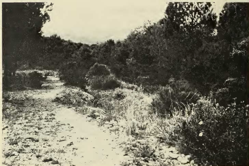
Fig. 3. Open place in pine forest at Taferiate, High Atlas, (nr. 11 on the map), biotope of Zerynthia rumina L., Tomares ballus F., T. mauretanicus LUCAS and several other interesting species.